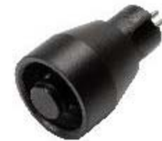
203975 - Adapter SIRONA B