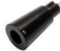
203968 - Adapter KAVO H B