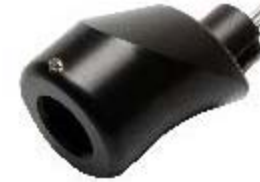
203971 - Adapter KAVO G B