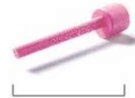
200295 - BOX OF 250 NON STERILE RISKONTROL TIPS (PINK)