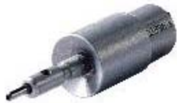
203906 - Adapter D.C.I