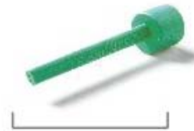
200290 - BOX OF 250 NON STERILE RISKONTROL TIPS (GREEN)