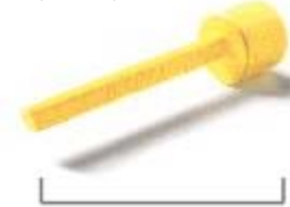
200285 - BOX OF 250 NON STERILE RISKONTROL TIPS (YELLOW)