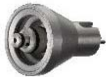
203978 - Adapter CEFLA DENTAL GROUP