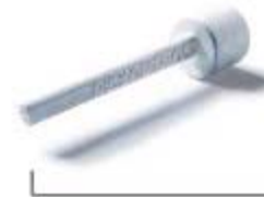
200275 - BOX OF 250 NON STERILE RISKONTROL TIPS (WHITE)