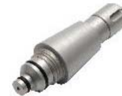
203873 - Adapter BELMONT NEW