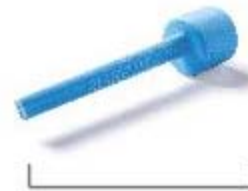
200280 - BOX OF 250 NON STERILE RISKONTROL TIPS (BLUE)