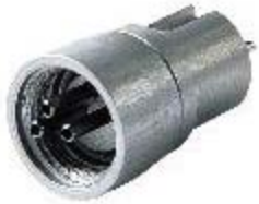
203919 - Adapter LU