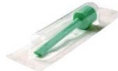
200265 - BOX OF 100 STERILE RISKONTROL TIPS (GREEN)