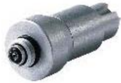
203880 - Adapter ADEC II